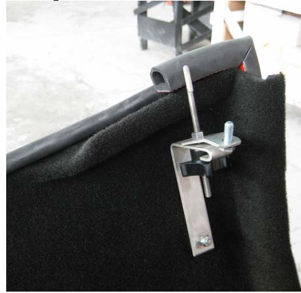
Rear attachment hook assembly with adapter plate and bolt (2)