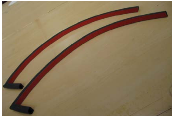
Side Window Rubber Seals (pr)