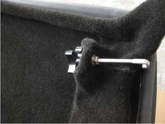
Front attachment hook & knob assembly (2)