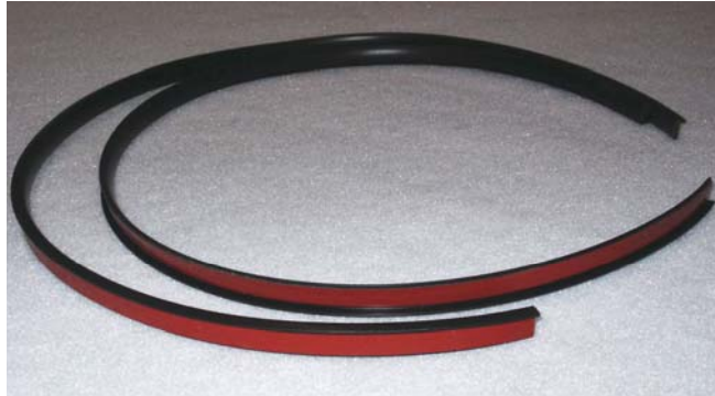
Side Window Drip Guard Moldings (pr)

Included in your shipping carton are parts which are necessary in the final assembly of the Hardtop as shown below