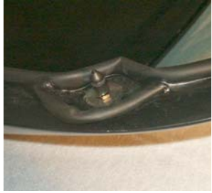
Rear attachment pin OEM assembly (2) Right shown