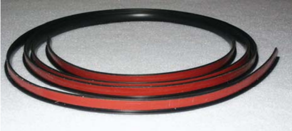
Trailing Edge Trim Molding