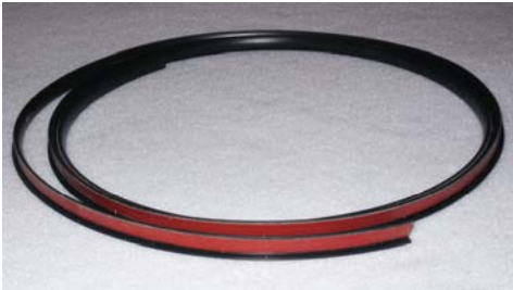
Leading Edge Trim Molding