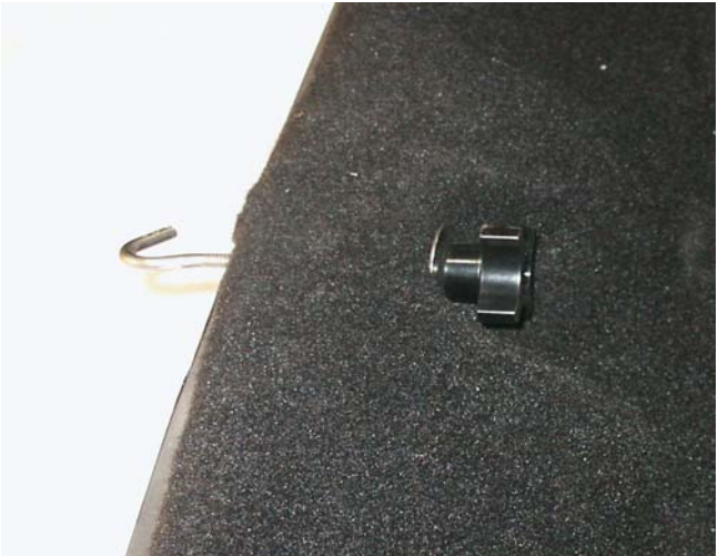
Front attachment hook & knob assembly