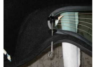
Rear attachment hook (2) Passenger shown