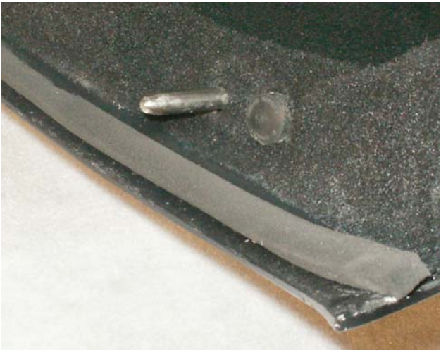
Front locator pin (2) Passenger shown