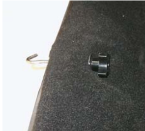
Front attachment hook & knob assembly