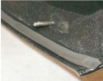
Front locator pin (2) Passenger shown