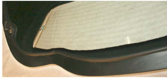
Rear inner seal