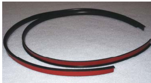
Side Window Drip Guard Moldings (pr)

Included in your shipping carton are parts which are necessary in the final assembly of the Hardtop as shown below