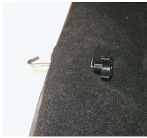
Front attachment hook & knob assembly