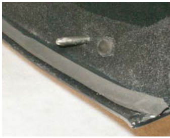
Front locator pin (2) Right shown