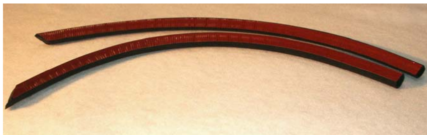
Side Window Rubber Seals