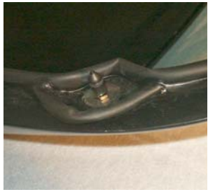
Rear attachment pin OEM assembly (2) Right shown